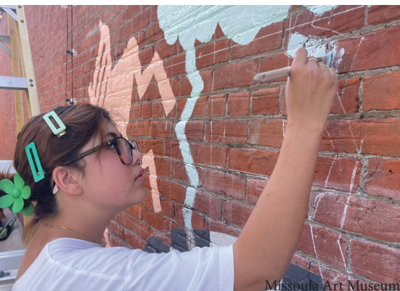
Missoula Art Museum