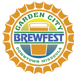
GARDEN CITY BREWFEST First Saturday in May