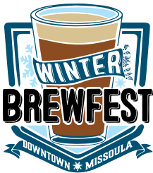
WINTER BREWFEST Late February