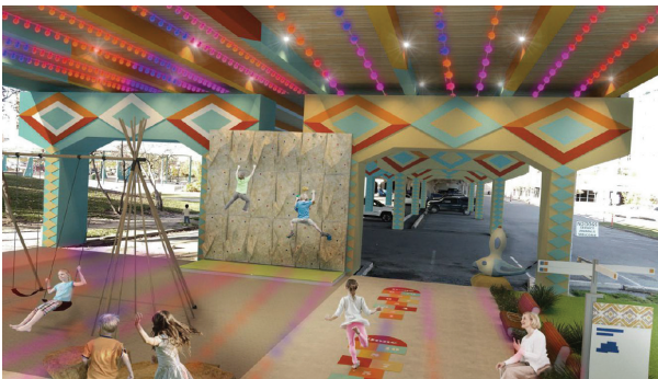
Underbridge Play Space Concept, Caras Park