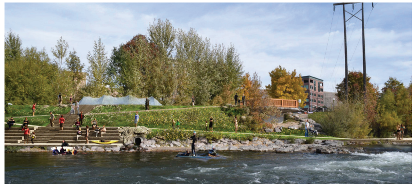
Proposed Riverfront Terrace, Caras Park

The grand funds come from EDA’s $240 million competitive American Rescue Plan Travel, Tourism, and Outdoor Recreation program. Missoula’s grant comes from the $2.9 million allocated to Montana. The upgrades will improve access to the river and water for people of all ages and abilities. Learn more about the North Riverside Parks & Trails Plan at www.missouladowntown.com .