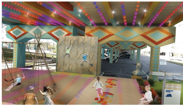
Underbridge Play Space Concept, Caras Park