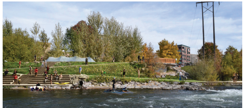
Proposed Riverfront Terrace, Caras Park

With the completion of phase I, plans are already underway for the next phase of park improvements. The implementation team will focus energy on the underbridge play space. Through a partnership with the City of Missoula, a $1.2 million grant from the U.S. Economic Development Administration has been awarded to complete the river access near Brennan’s Wave.