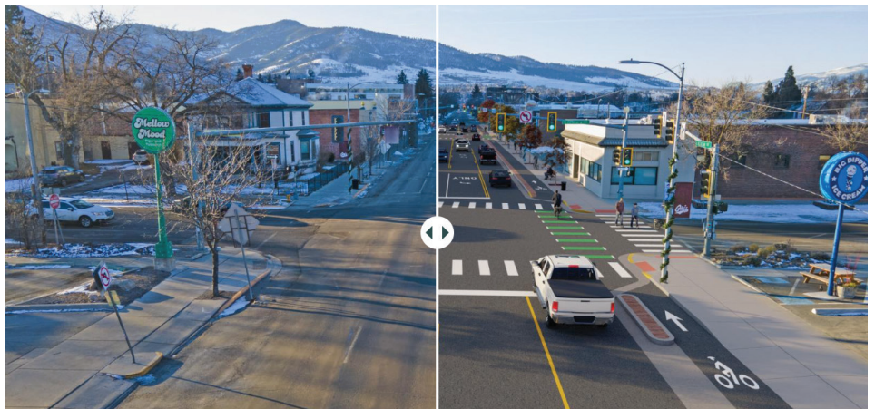
Preferred Higgins Corridor Alternate

The public input process identified Concept B, 3 lanes with raised bike lanes, as the preferred alternative. This concept would extend the existing design on Higgins north of Broadway south to Brooks Street. Learn more about this project at https://www.engagemissoula.com/higgins-avenue-corridor-plan .