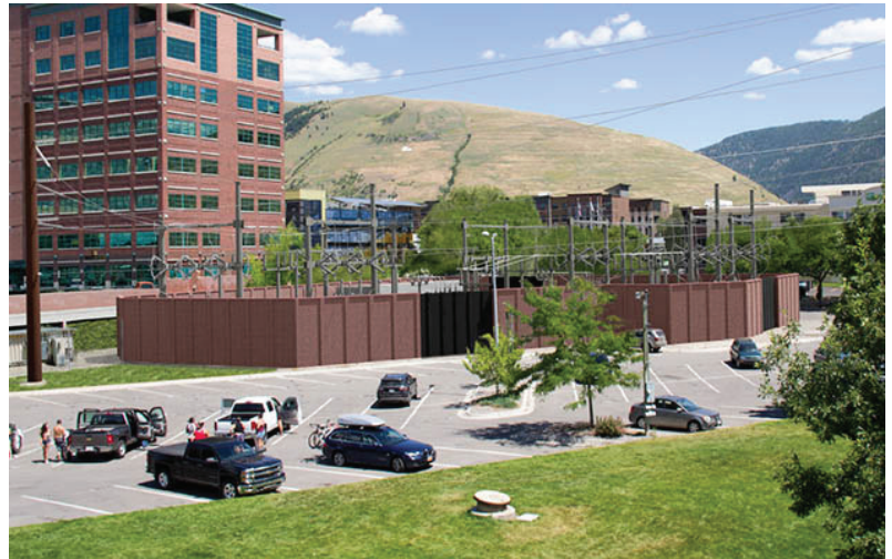
Rendering of the new North Western Energy substation

The Higgins Bridge upgrades should be completed by the end of June, and the Beartracks Bridge Dedication will take place on Saturday, July 16. The upgrades include four vehicle lanes and two wide shared-use pathways for pedestrians and bicyclists, along with new streetlights, railings, and stairs to Caras Park. MDT will also repave underneath the bridge, which will be converted into playground space in July. The Missoula Downtown Foundation continues to raise funds for the Underbridge Playground and the shade structure.